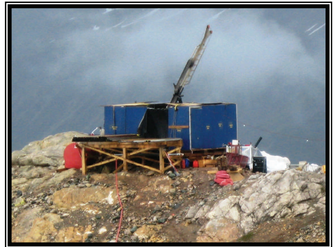
Drilling at Galore Creek

We anticipate starting the drill program in May when the snow clears. We will also carry out minor safety improvements on the access road, such as laying back steep cut slopes. There will be a variety of ongoing baseline environmental studies.