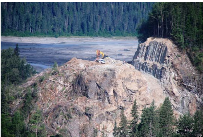
Section of Rock work, for impassable road connection

In the Spring we will be dealing with the Spring Freshet and will be looking after all maintenance concerning any environmental issues due to the Spring run off.